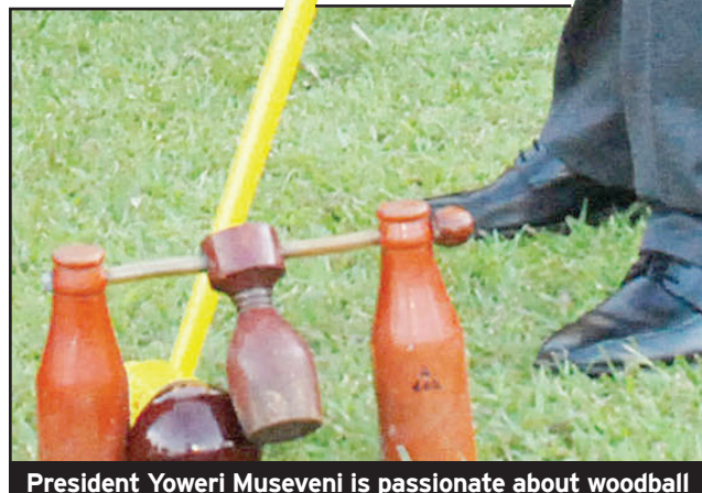
President Yoweri Museveni is passionate about woodball